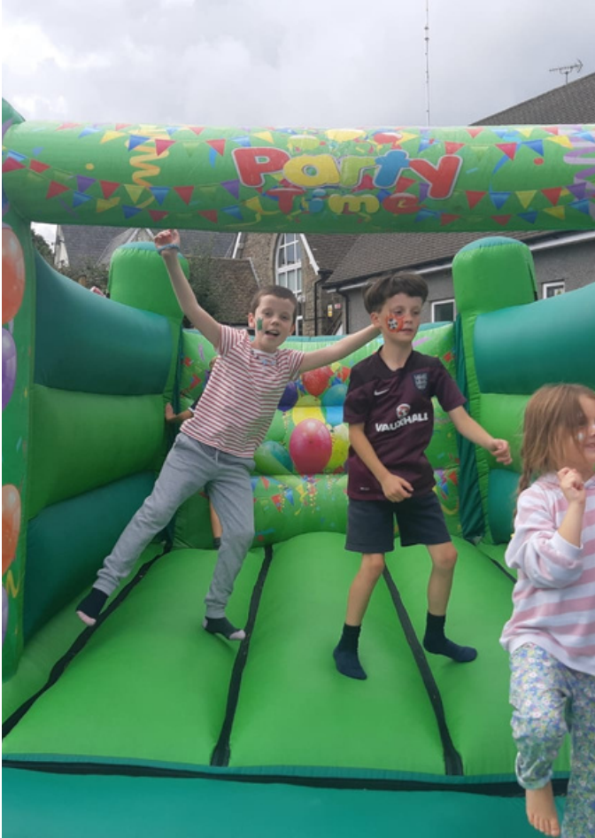
FYA & HAF