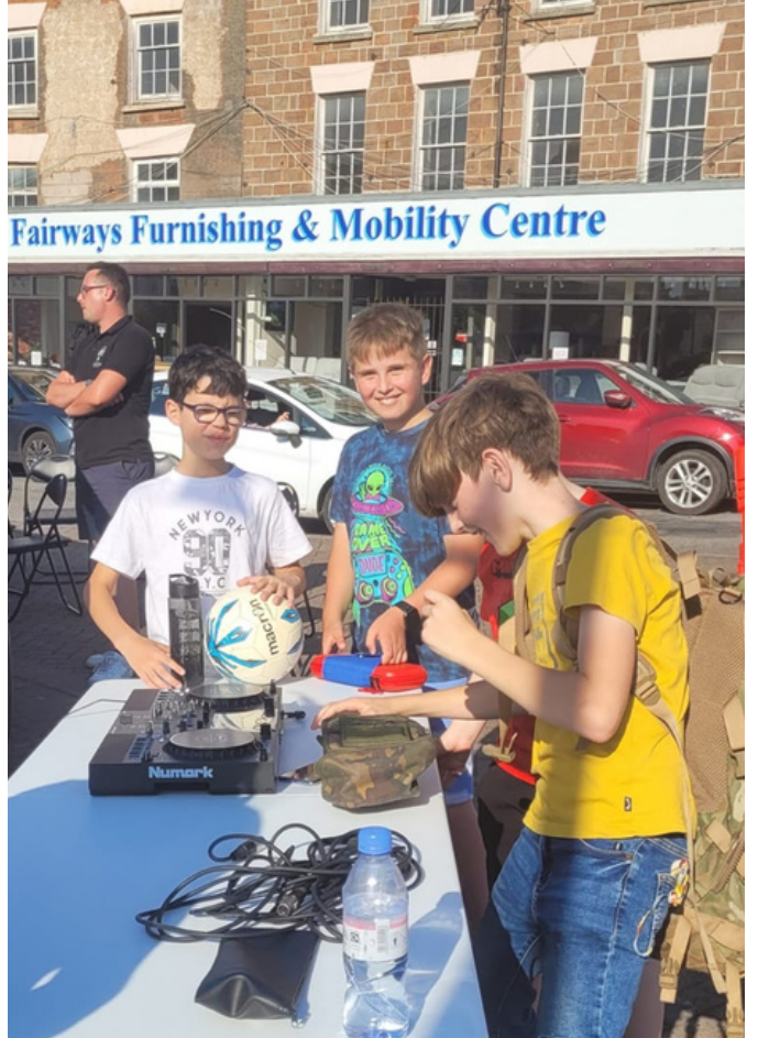
FYA & HAF